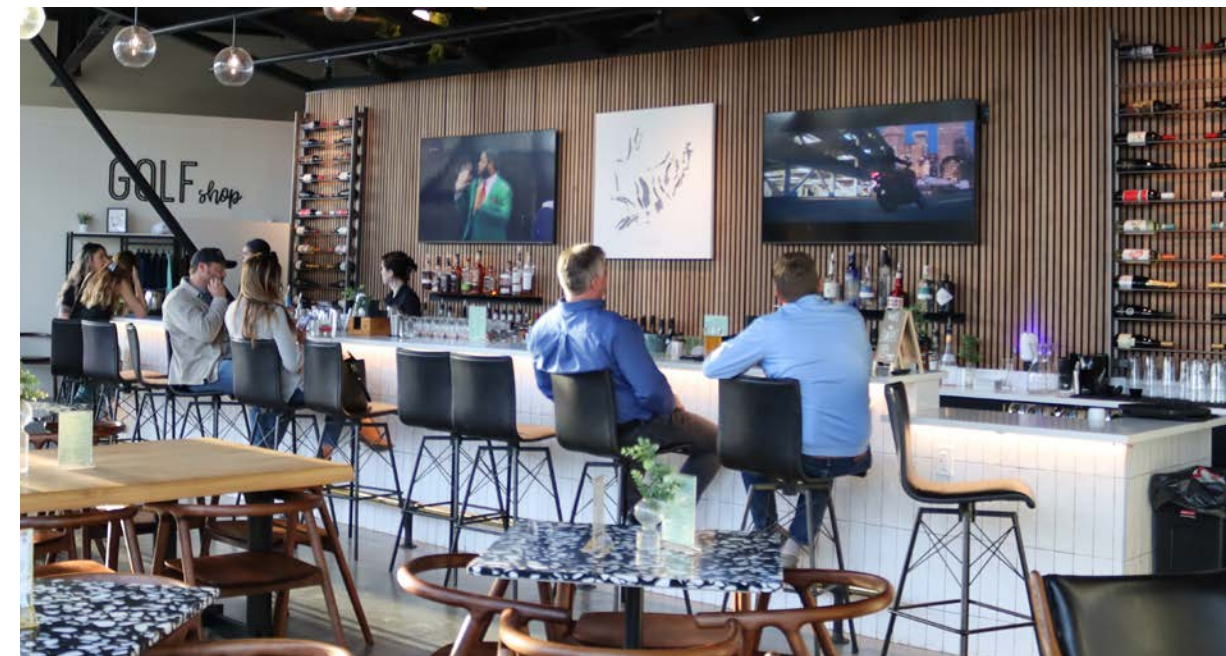
Four Score Golf Tavern, San Marco, Jacksonville (LEFT)