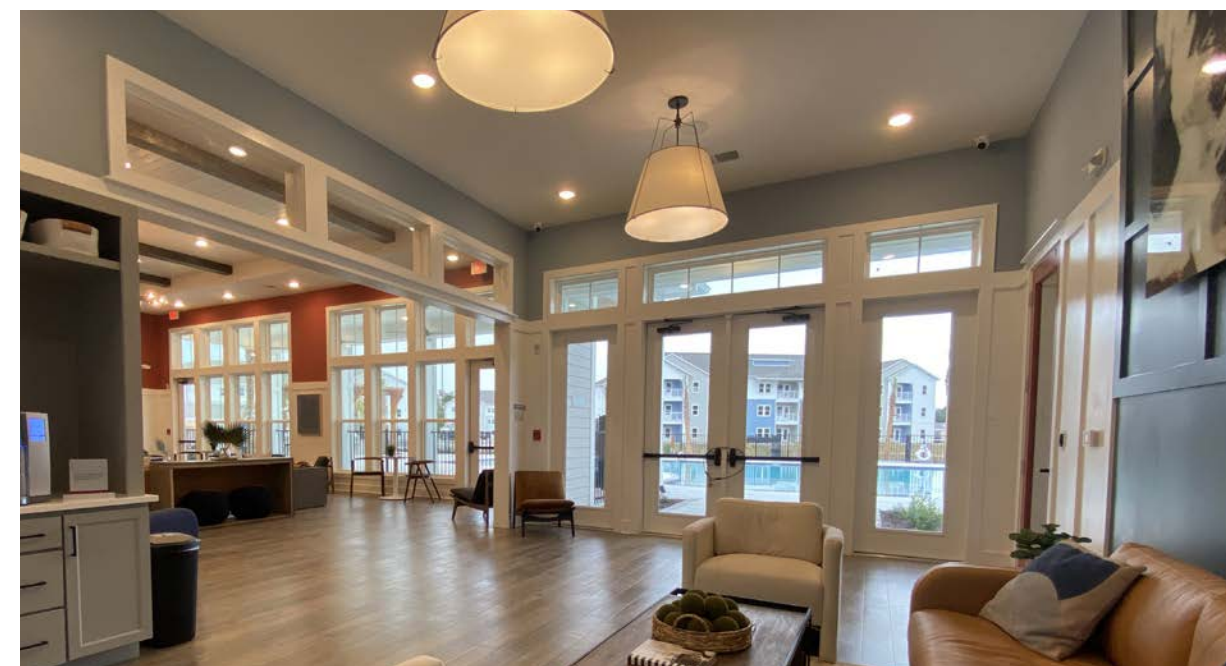
1st and Main, Springfield, Jacksonville (ABOVE)