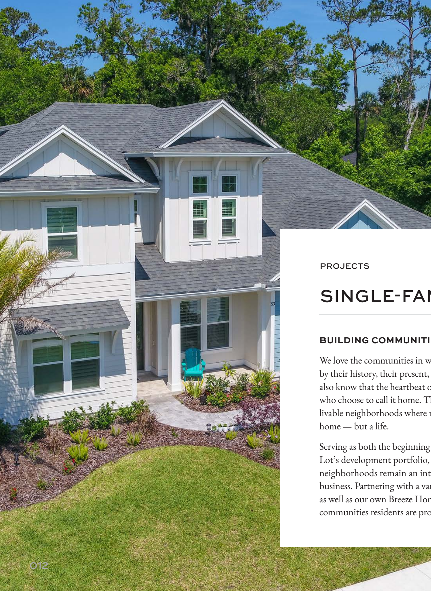
Preserve Pointe, Ponte Vedra Beach (LEFT)