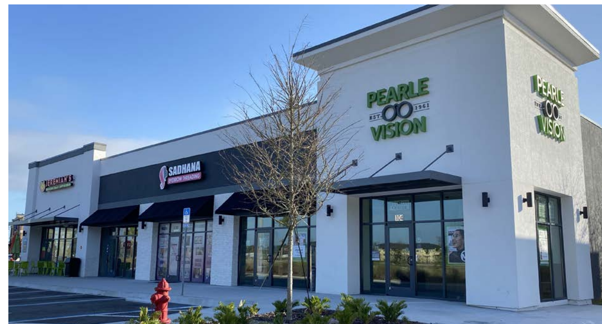
Parkway Phase I, Durbin Park, St. Johns County (LEFT)