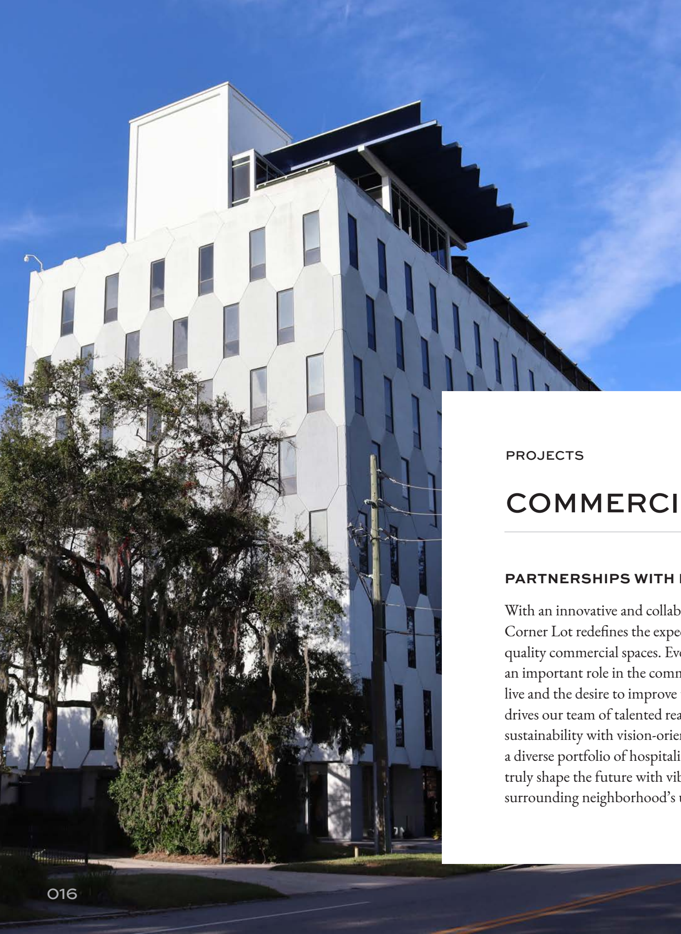
Corner Lot Center, Riverside, Jacksonville (LEFT)