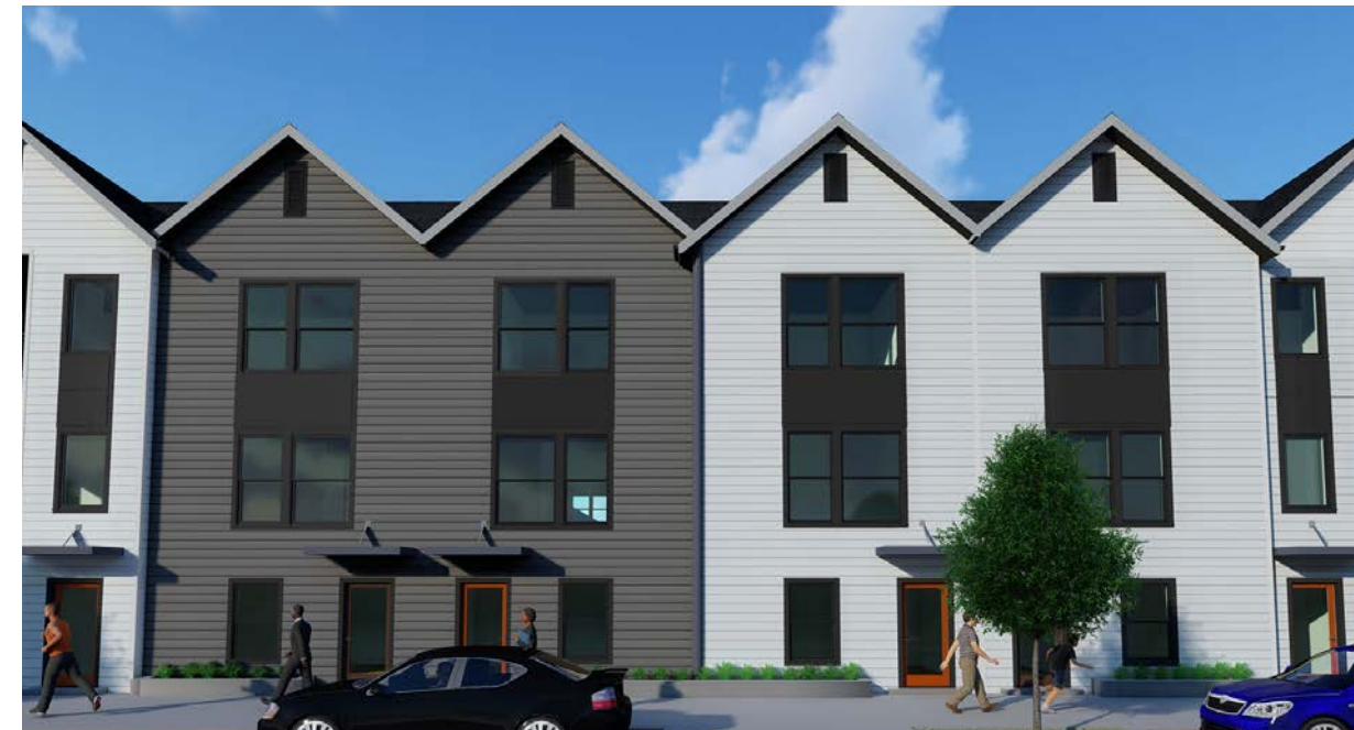
Palm Island, Jacksonville (ABOVE)