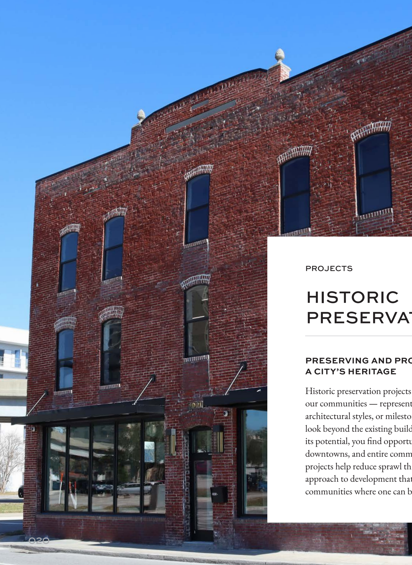
Industry West Headquarters, Downtown Southbank, Jacksonville (LEFT)