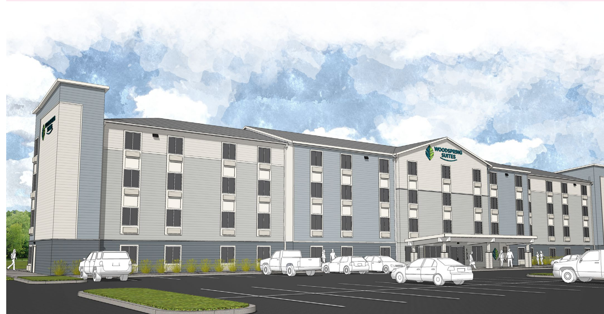
Woodspring Suites, St. Augustine, Florida (ABOVE)

Hospitality doesn't begin with the services provided by the hotel. Long before the development breaks ground, it starts with selecting a space that fulfills a need. It's about building a hotel that serves the surrounding community, provides proximity to restaurants and entertainment venues for guests, and drives tourism and economic development for local businesses. Fueled by a collaborative mindset, we know that each hospitality project must be a combination of three pivotal points: the right partner, the right time, and the right place. Experience ensures that we take the time to understand an area so we can build community-focused projects that spur additional development and support existing businesses.