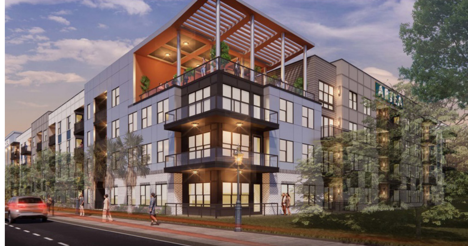
Artea, Downtown Jacksonville (ABOVE)

Great cities take work. They require reimagining and sometimes even reinventing our urban spaces to showcase the beauty of our community — and its potential. Blending innovation, sustainability, new development, and preservation, Corner Lot sets the standard for developing projects that won't just define a city, but also encourage its ongoing evolution far into the future. With people and places at the heart of Corner Lot, our team is driving Northeast Florida's transformation into the ideal destination to live, work, play, and visit.