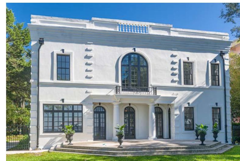
The Goodwin House, Corner Lot Headquarters, Riverside, Jacksonville (LEFT)