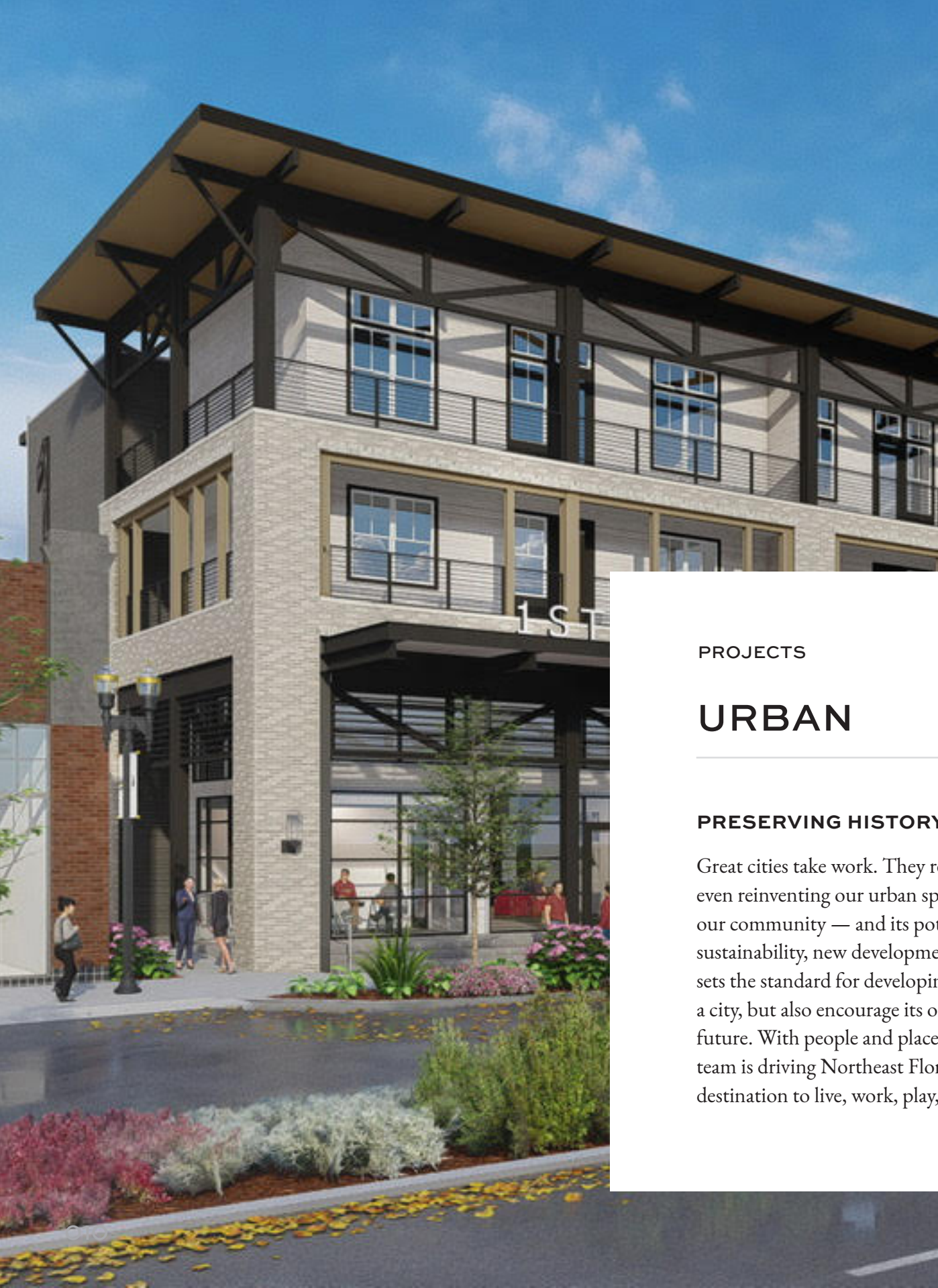
1st and Main, Springfield neighborhood, Jacksonville (LEFT)