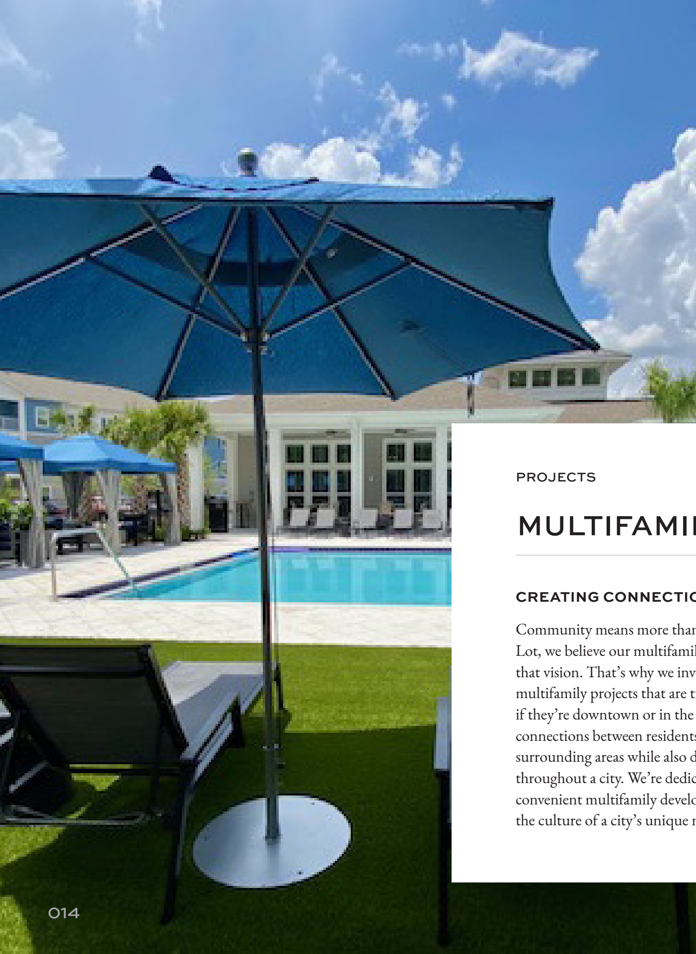
The Avery, Jacksonville (LEFT)