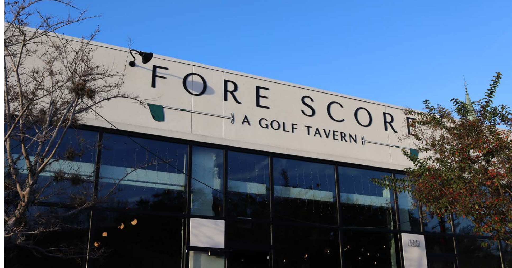
Four Score Golf Tavern, San Marco, Jacksonville (ABOVE)

With an innovative and collaborative approach to development, Corner Lot redefines the expectations and experiences of quality commercial spaces. Every commercial development plays an important role in the communities where our neighbors live and the desire to improve the landscape of a city is what drives our team of talented real estate professionals. Merging sustainability with vision-oriented development, we're building a diverse portfolio of hospitality, retail, and office spaces that will truly shape the future with vibrant structures that reflect the surrounding neighborhood's unique qualities.