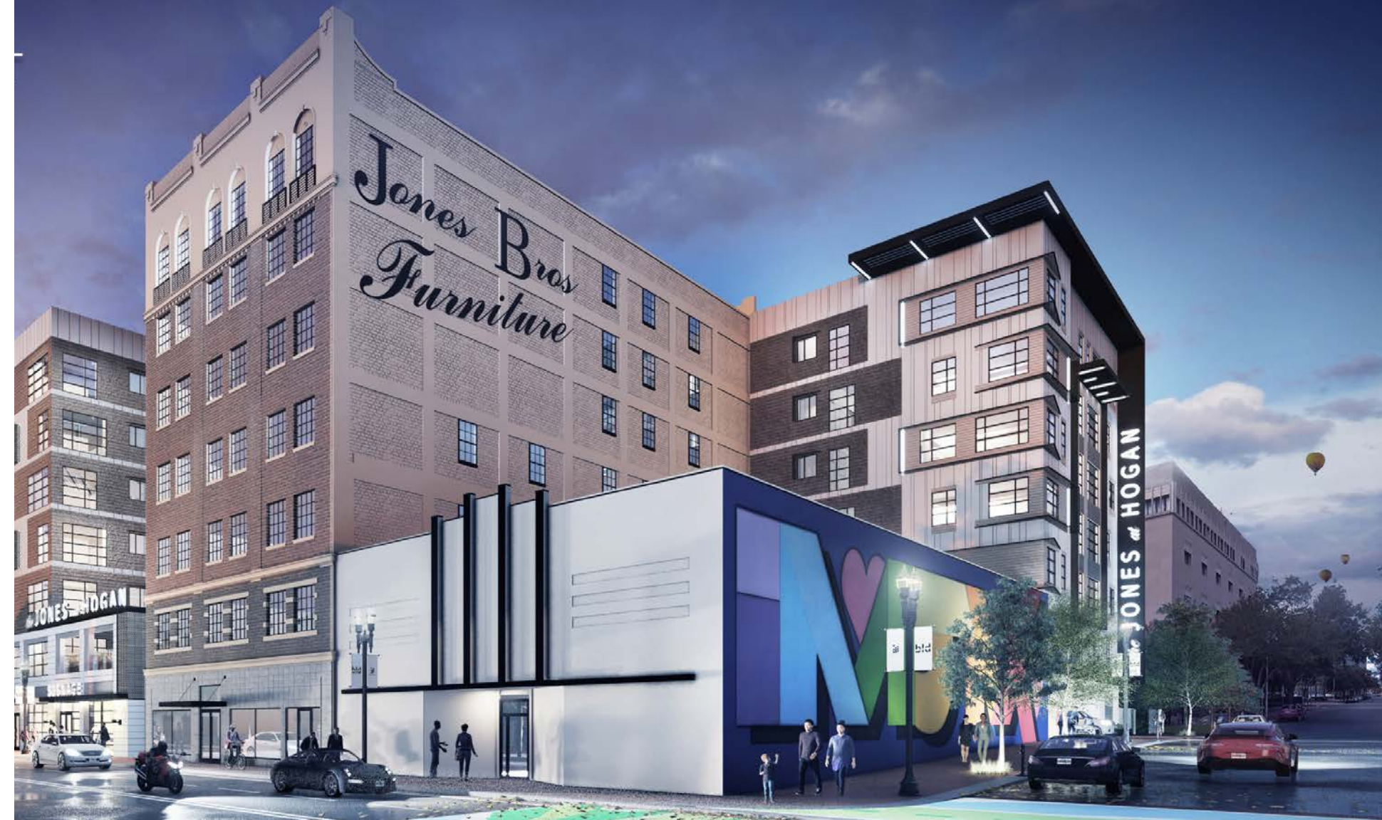
Jones on Hogan, Downtown Jacksonville (ABOVE)

Historic preservation projects create a strong foundation for our communities — representing significant time periods, architectural styles, or milestones in a city's history. When you look beyond the existing building's time-weary exterior and see its potential, you find opportunities to revive neighborhoods, downtowns, and entire communities. Our historic preservation projects help reduce sprawl through a sustainable and efficient approach to development that creates more vibrant, healthy communities where one can be proud to live, work, and play.